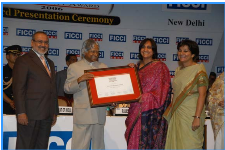
FICCI Special Jury Award from the Former President of India