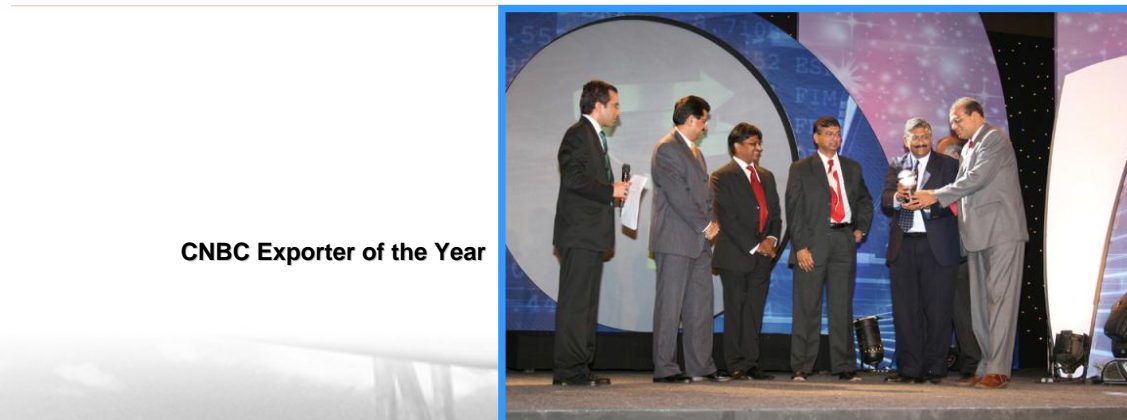
CNBC Exporter of the Year